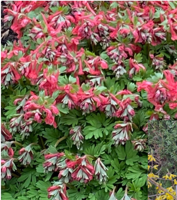
Corydalis by N. Boudreau

North Island Rhododendron Society Vol. 40 Number 8 April 2026