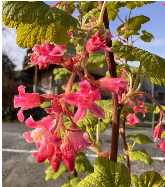
Red Flowering Currant by M. Griffith-Cochrane

April is always a busy month, and really, I need more days in the month, so many jobs to do in the garden. One job to avoid is to do too much cleaning up of the garden debris under the rhodos and other shrubs... those old leaves and twigs will be providing homes for the many native pollinators in our gardens for a few more weeks.