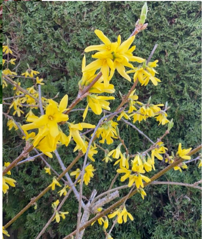
Forsythia