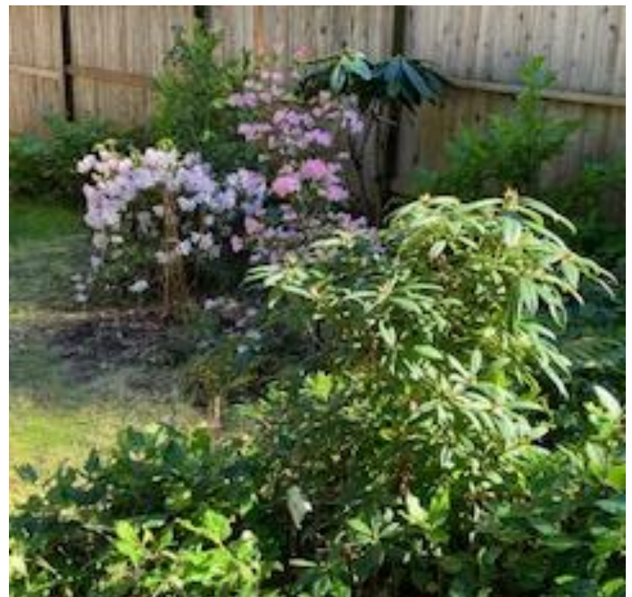
Flowering on Rt. – R. moupinese Lt. – R. 'Seta' & R. kesangiae (larges leaved Rt. Back)

Thank you Valerie & Aubrey for the picture garden tour of your garden.