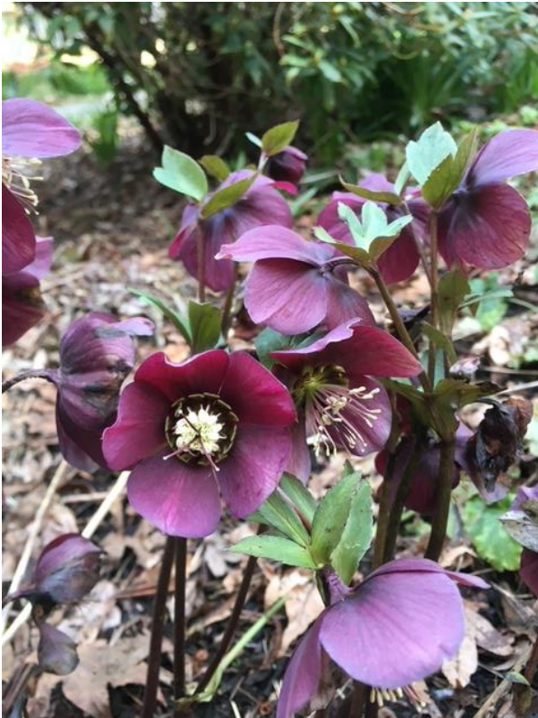
Hellebores by K. Selden

May 9-10 MARS Mother's Day weekend Garden Tour. Tickets $20.00 at Garden Centres in April.