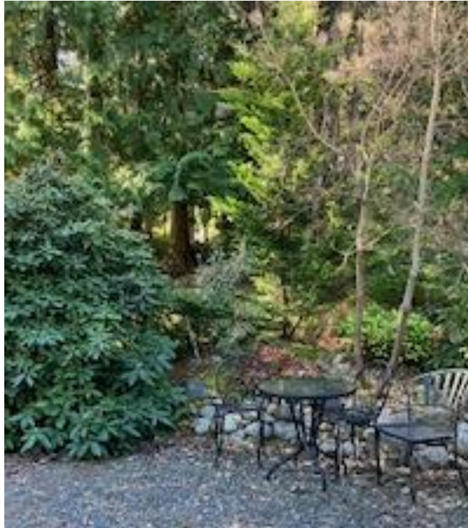
R. 'Rosamundii' (flowering)