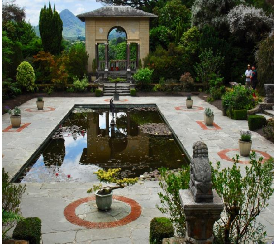
The Gardens at Ilnacullin, Co. Cork