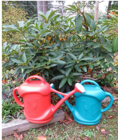
R. ‘Jean Marie de Montague’ one year after cutting back

Rhododendrons, once they are happily established, can grow into large shrubs. Indeed, some turn into trees. Pictures of rhododendron forests in Nepal come to mind: R. arboreum is a case in point. The first thing, when planting, is to choose a variety which will remain somewhat compact. But “grows to five feet in ten years” does not mean it stops growing in ten years! So do not plant it against the wall of your house, next to the driveway, or under a window. For those folks who have inherited huge rhododendrons on their property from a previous owner, outright removal is often what the homeowner will choose. Pruning is an easier alternative. There have been cases where we have cut every branch down to one foot or so, moved the plant, and had the rhodo come back in a year or so happier than ever. Pruning is best done after flowering, thus giving the plant time to put on new growth during the summer. Following basic rules on pruning, do not leave stubs! And here is the magic thing: even if you cut right back to the main stems, hidden buds on that stem start to form new growth. You may not get flowers for a year, but your plant, with proper fertilization and regular watering, will survive.