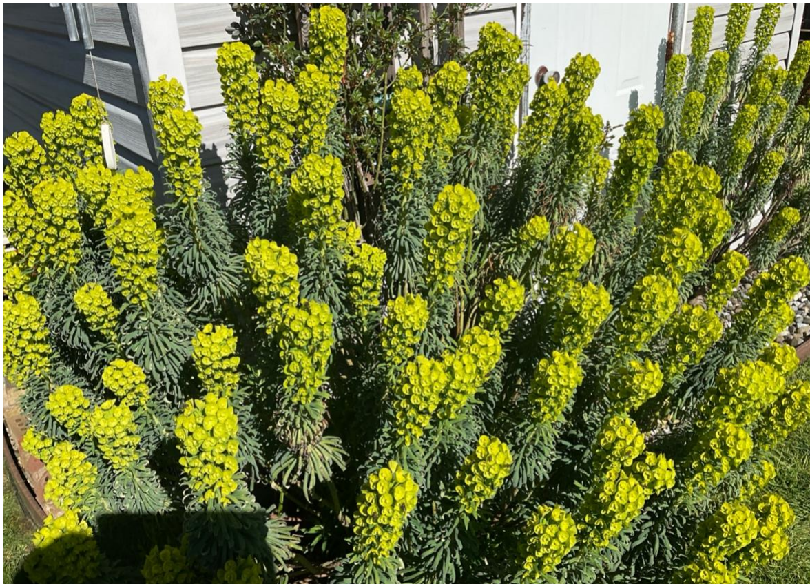
Euphorbia by D. Godfrey